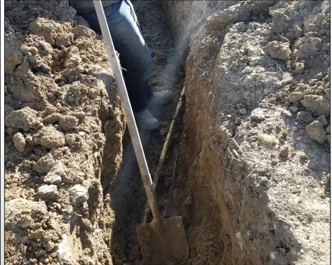
Repair visible in picture at employee's feet