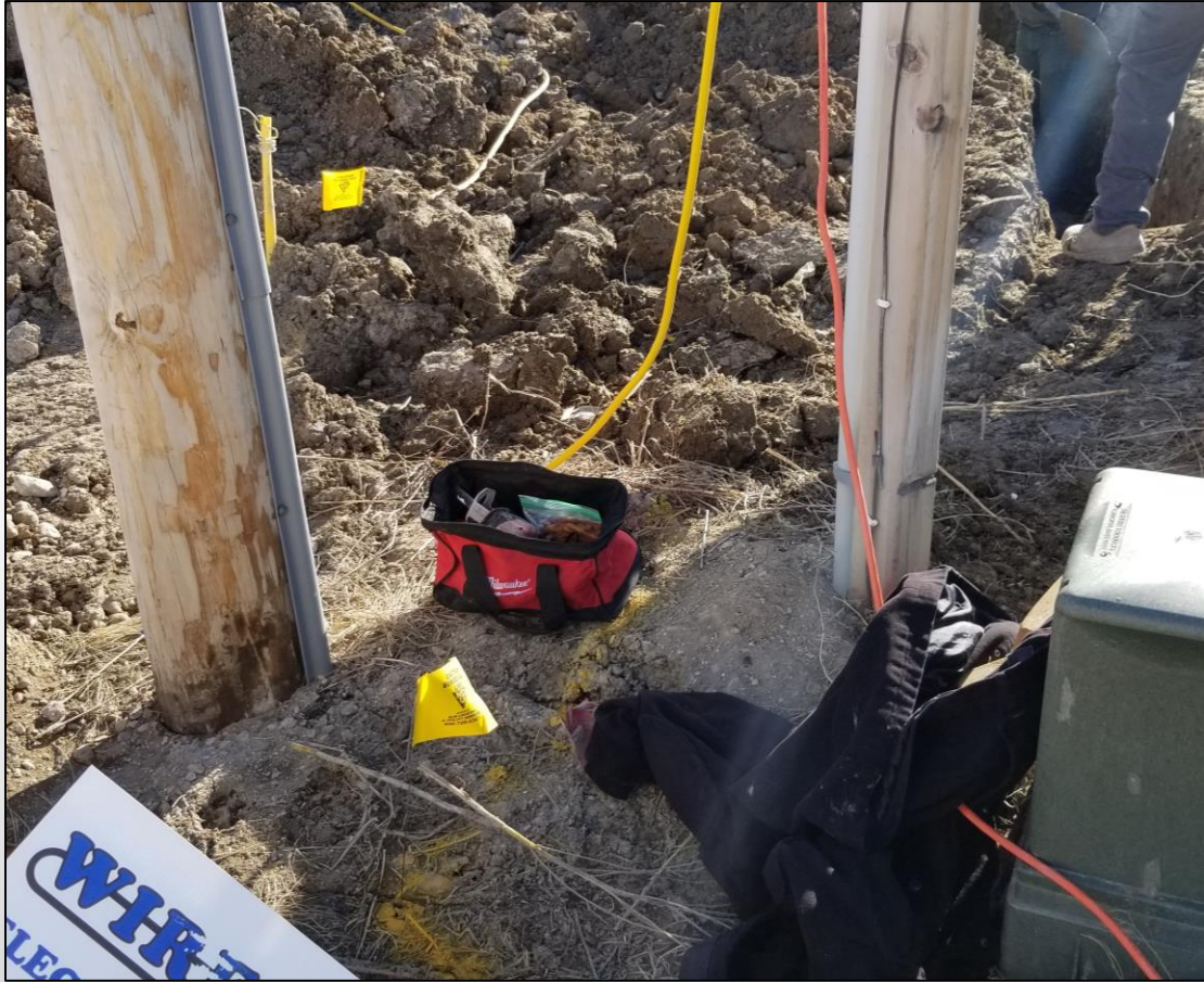
Picture taken the next day shows paint from locating during damage investigation the night before.