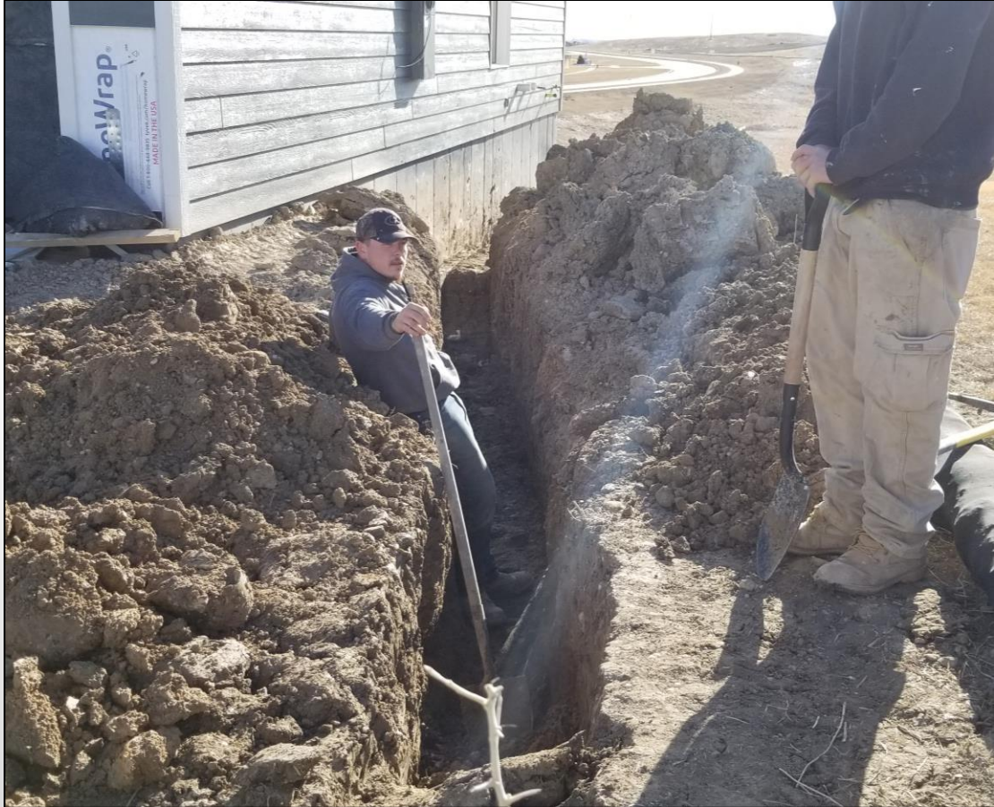
Damaged line shown in picture taken the next morning is several feet into the property where employee is standing