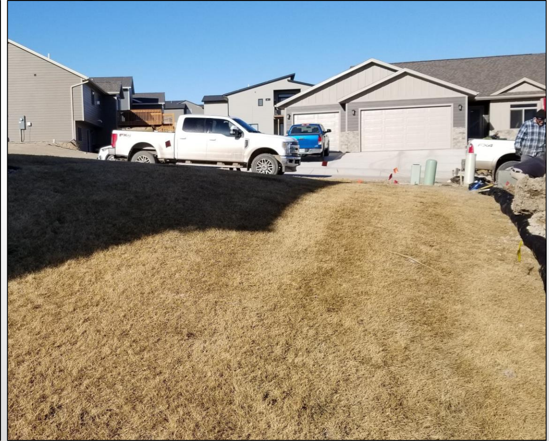
Flag to the right shows where Gas service enters the property next door where work is taking place